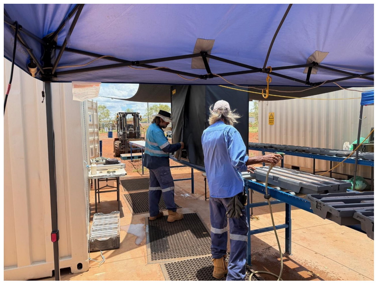
Figure 1: Dazzler Diamond Drilling EIS program core processing Feb 2025