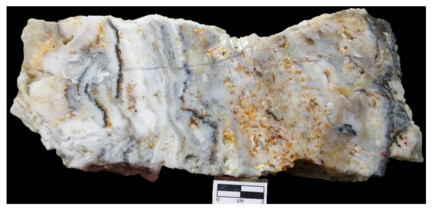
Figure 1: Image of a quartz vein sample from the Rek Rinti vein system showing black, sulphide rich ginguro bands. Sample assay returned grades of 38.14 g/t Au, 581 g/t Ag

The Company has built on the previous exploration work and seen remarkable results so far that include extending the total strike length of known vein systems to 13,000m and confirming presence bonanza grade Au with assay results of up to 119g/t gold and 1,179 g/t silver . The high grades occur within vein samples exhibiting ginguro bands which are an important textural feature common to high grade vein deposits such as Gosowong in Indonesia (6Moz gold at grades of 20-40 g/t) and Hishikari in Japan (8Moz gold at grades of 30-40g/t).