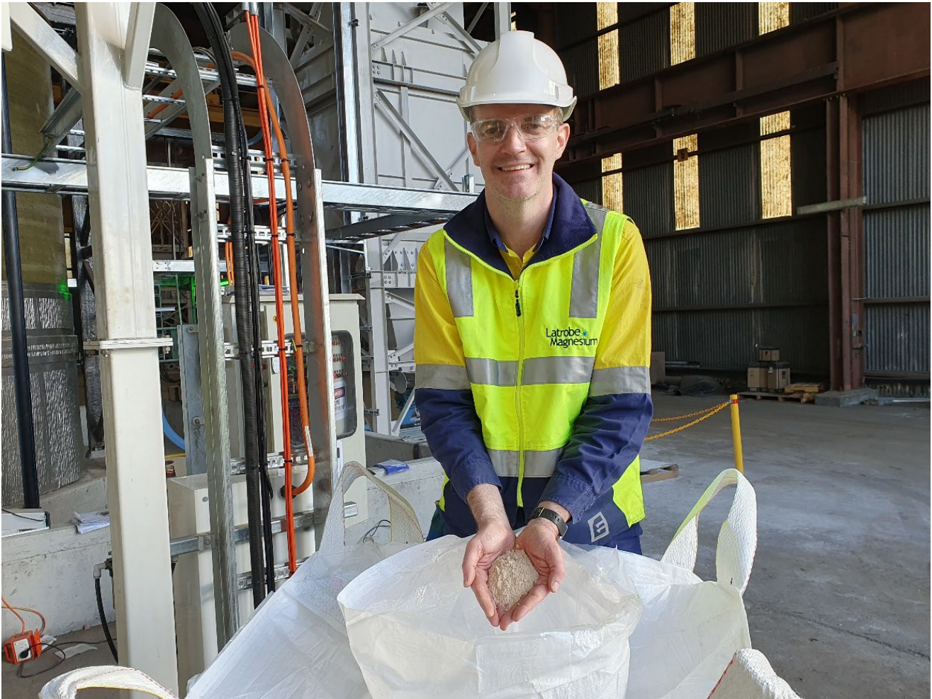
Figure: Environmentally sustainable Magnesium Oxide (MgO) produced using Fly Ash