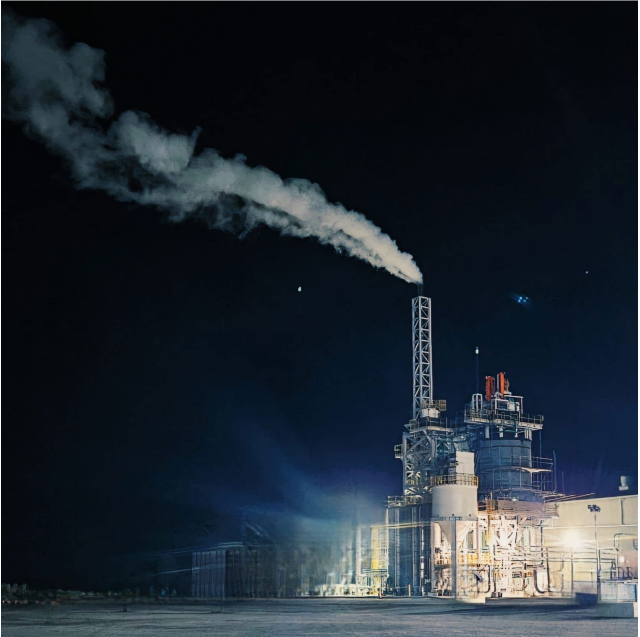
Figure: Demonstration Plant's Spray Roaster operating

Should you have any queries in relation to this announcement please do not hesitate to contact the CEO on his mobile 0421 234 688.