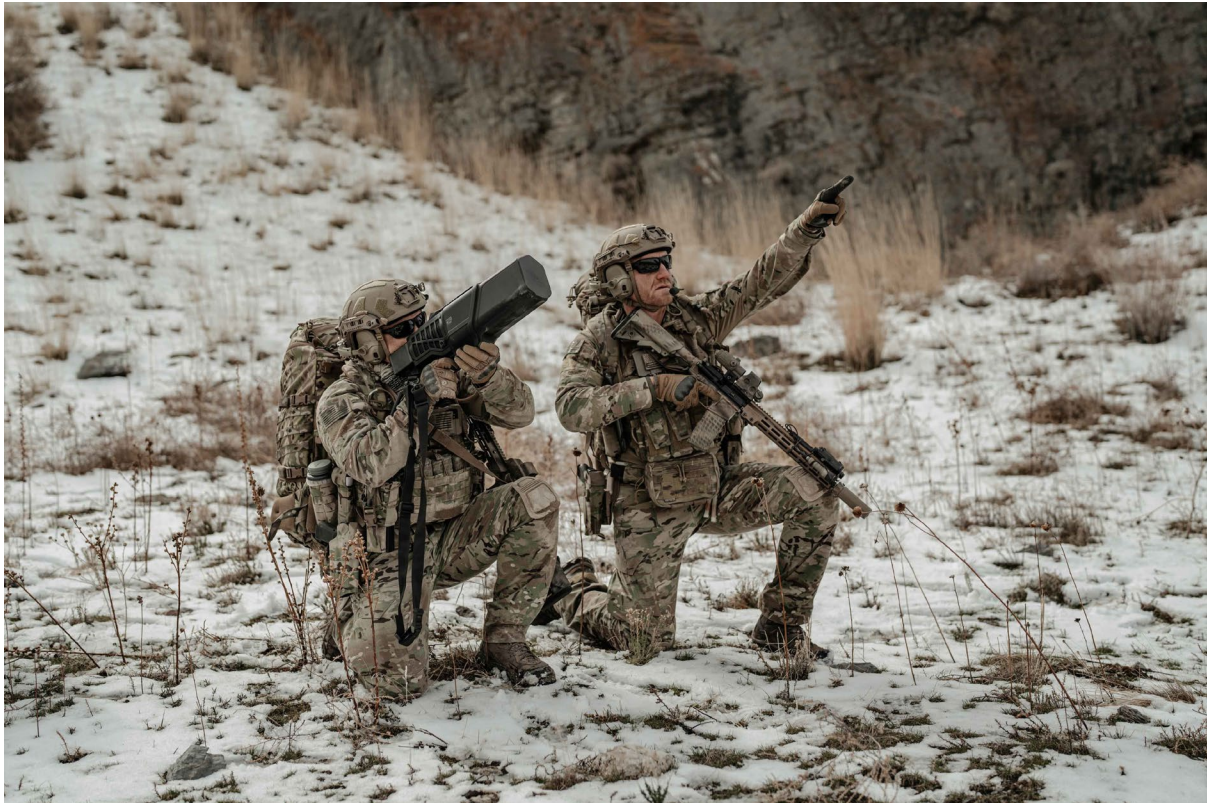
Image: DroneShield DroneGun Mk4 drone defeat system

This announcement has been approved for release to the ASX by the Board.